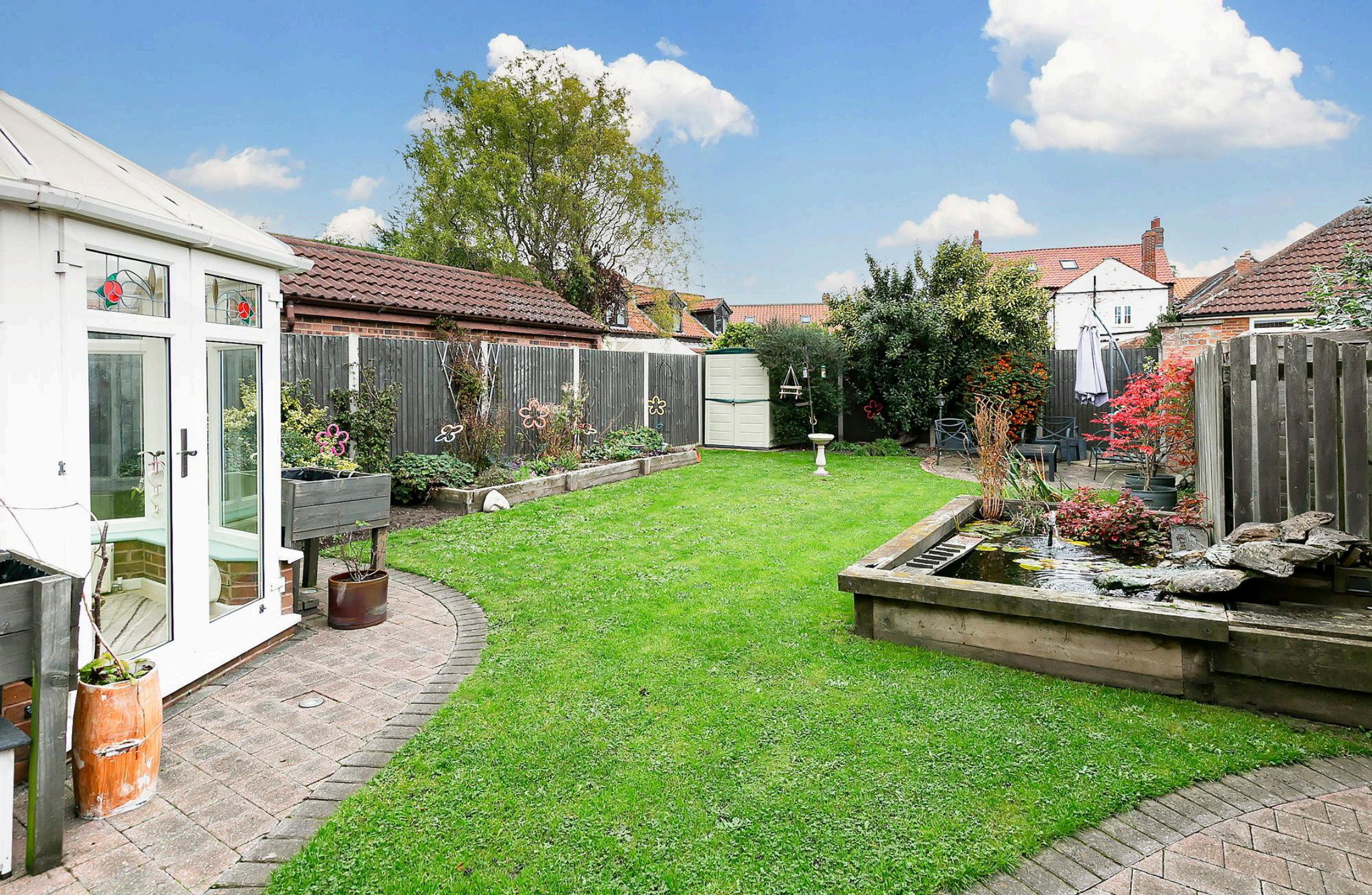
AN ATTRACTIVE FAMILY HOME IN THE HEART OF MARKET WEIGHTON