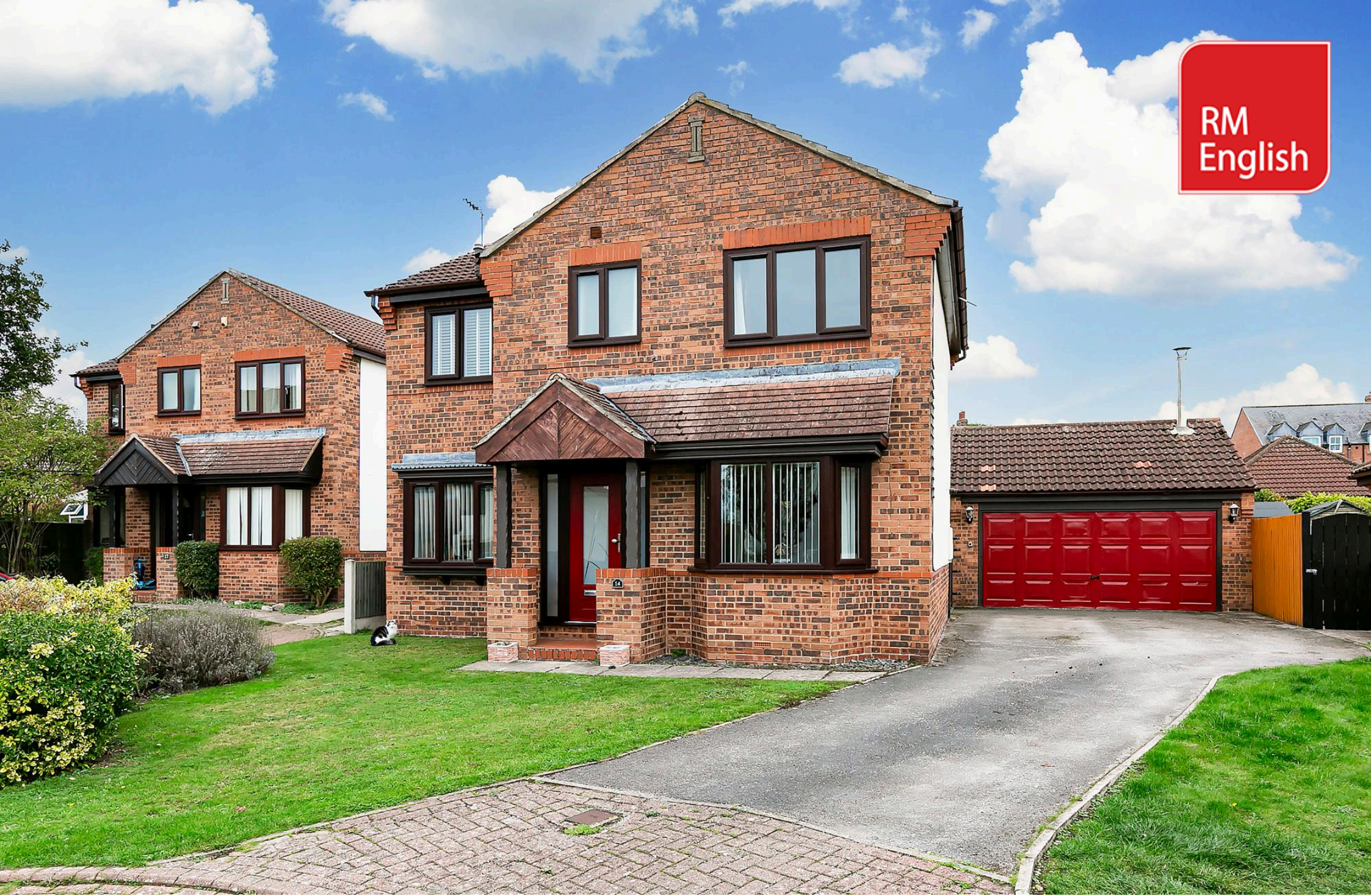
Northgate Grove, Market Weighton, York, YO43 3DX