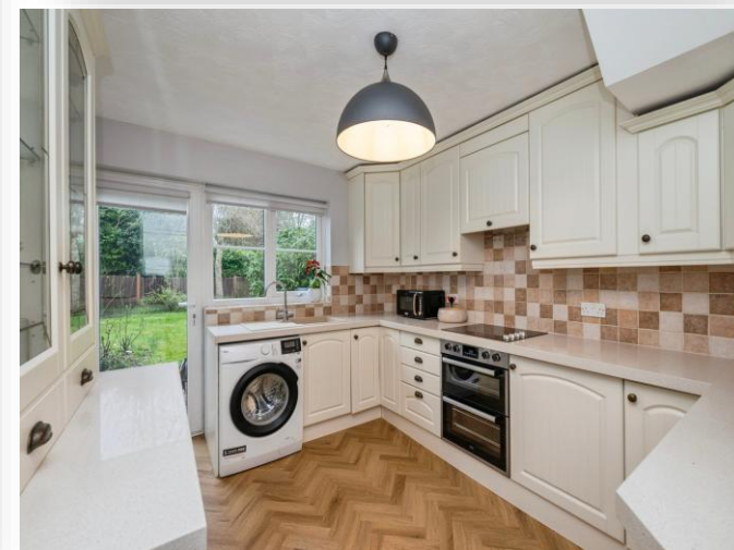
School View, Heydon Road, Corpusty, Norwich, NR11 6QQ