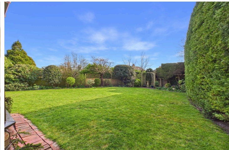
Property details: The Street | Shoreham by Sea | BN43 5NJ