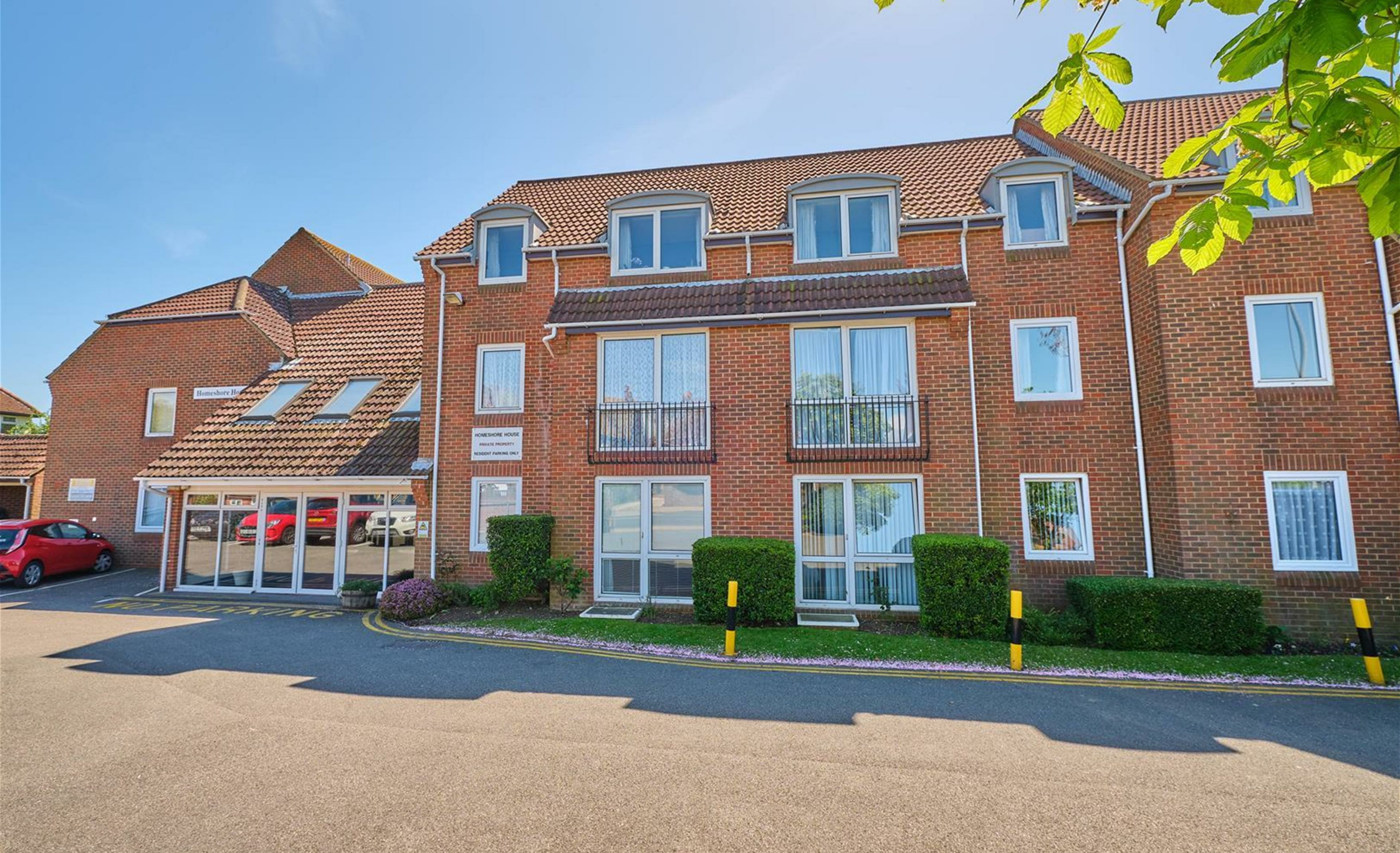
38 Homeshore House Sutton Road, Seaford, BN25 4QQ