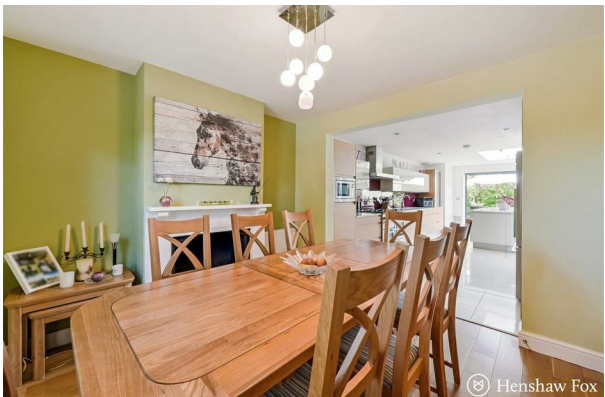
4 Waterworks Cottages | £550,000 New Road, Timsbury, Hampshire, SO51 0NL