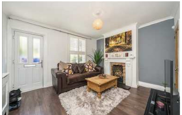
Red Lion Lane, SE18