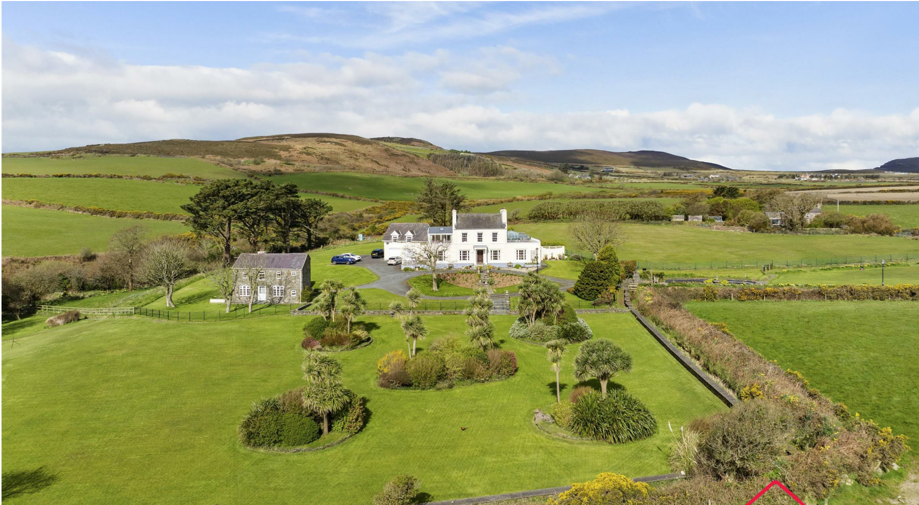
Burnbrae Ballakilpheric, Colby, Isle Of Man, IM9 4BT Asking Price £1,600,000