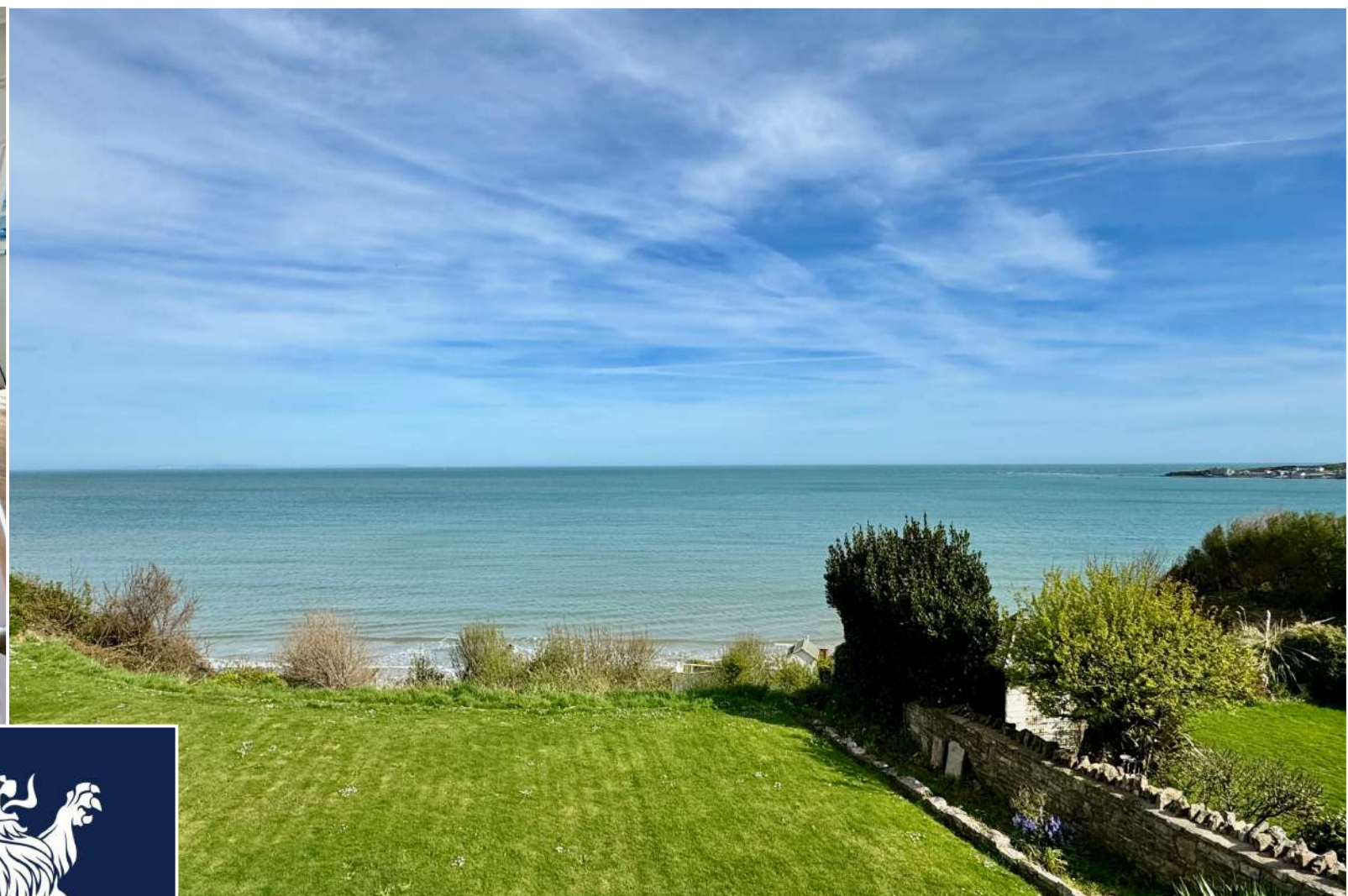
Location - North Beach