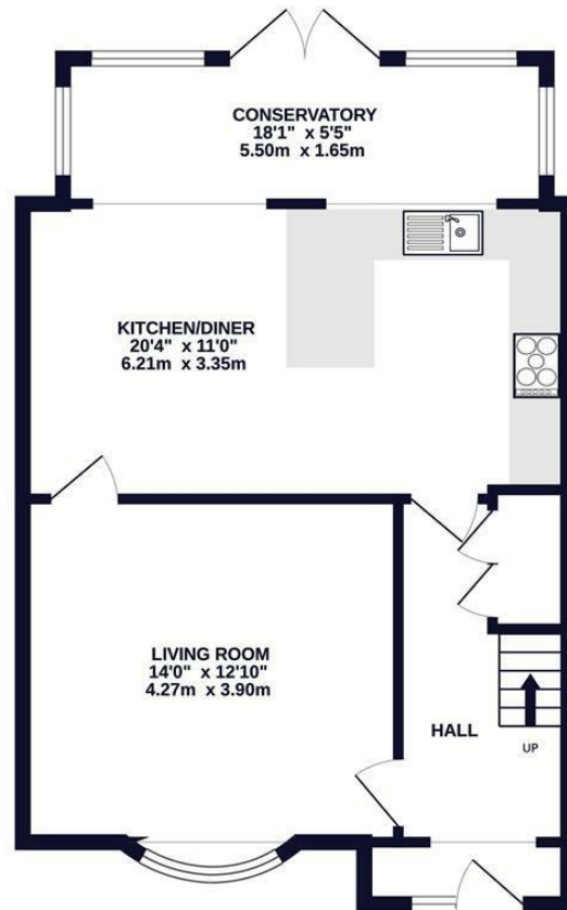
GROUND FLOOR 606 sq.ft. (56.3 sq.m.) approx.