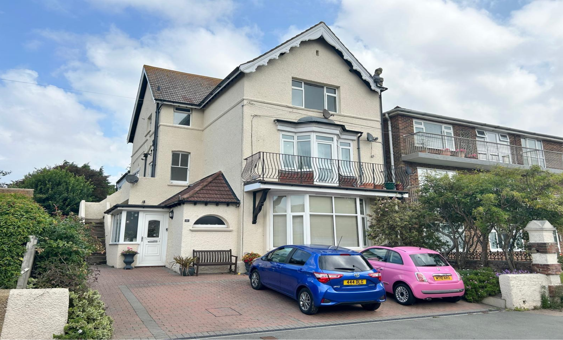
Magdalen Road, Bexhill-On-Sea TN40 1SB