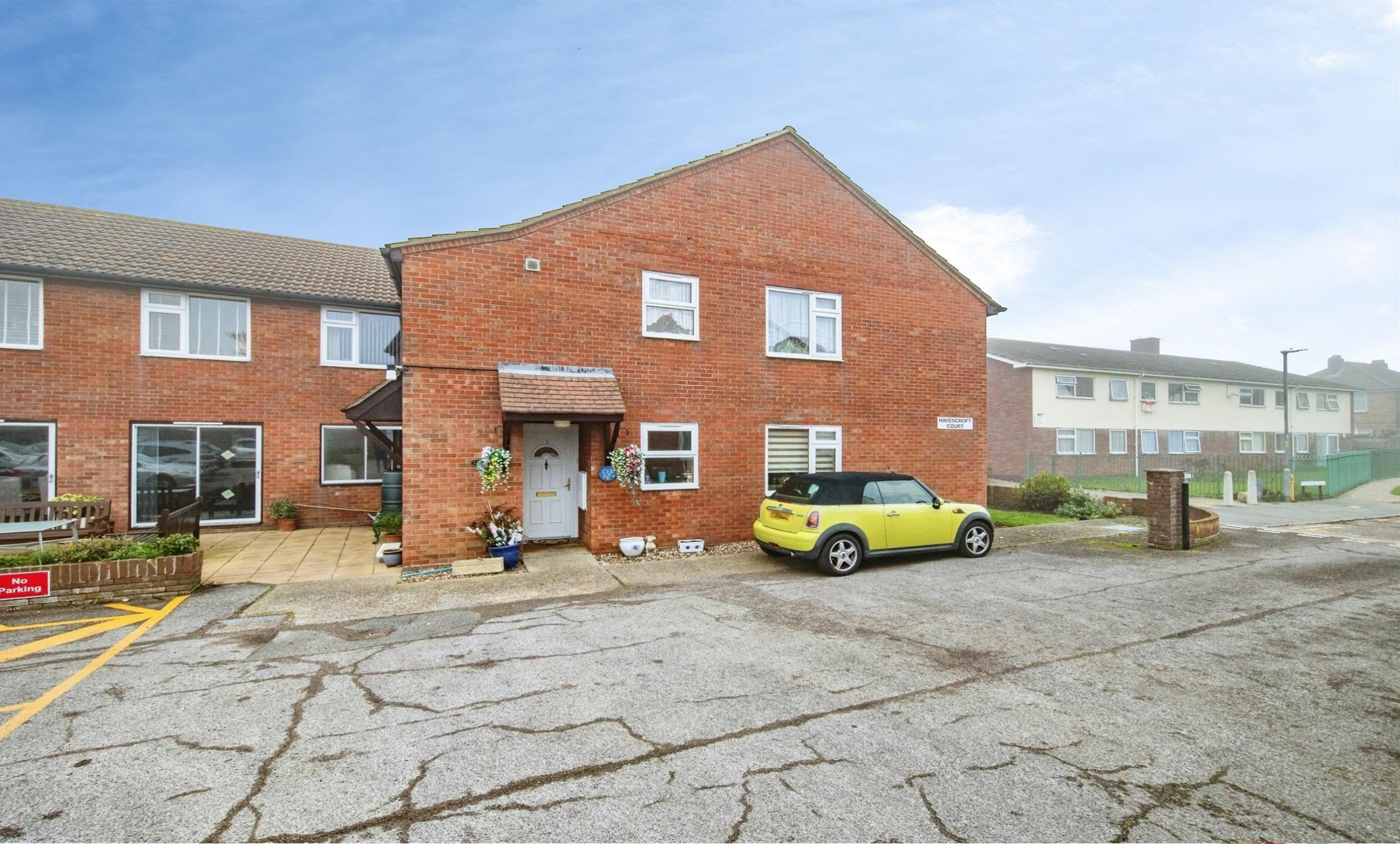
Havencroft Court North Street, Walton On The Naze CO14 8PS