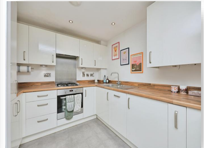
Cordwainer Close, Sprowston, Norwich, NR7 8GT