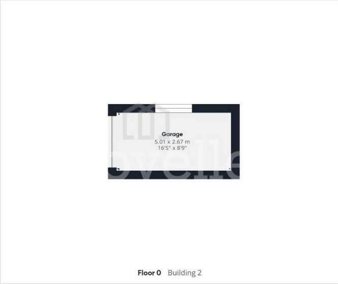
Floor 0 Building 2