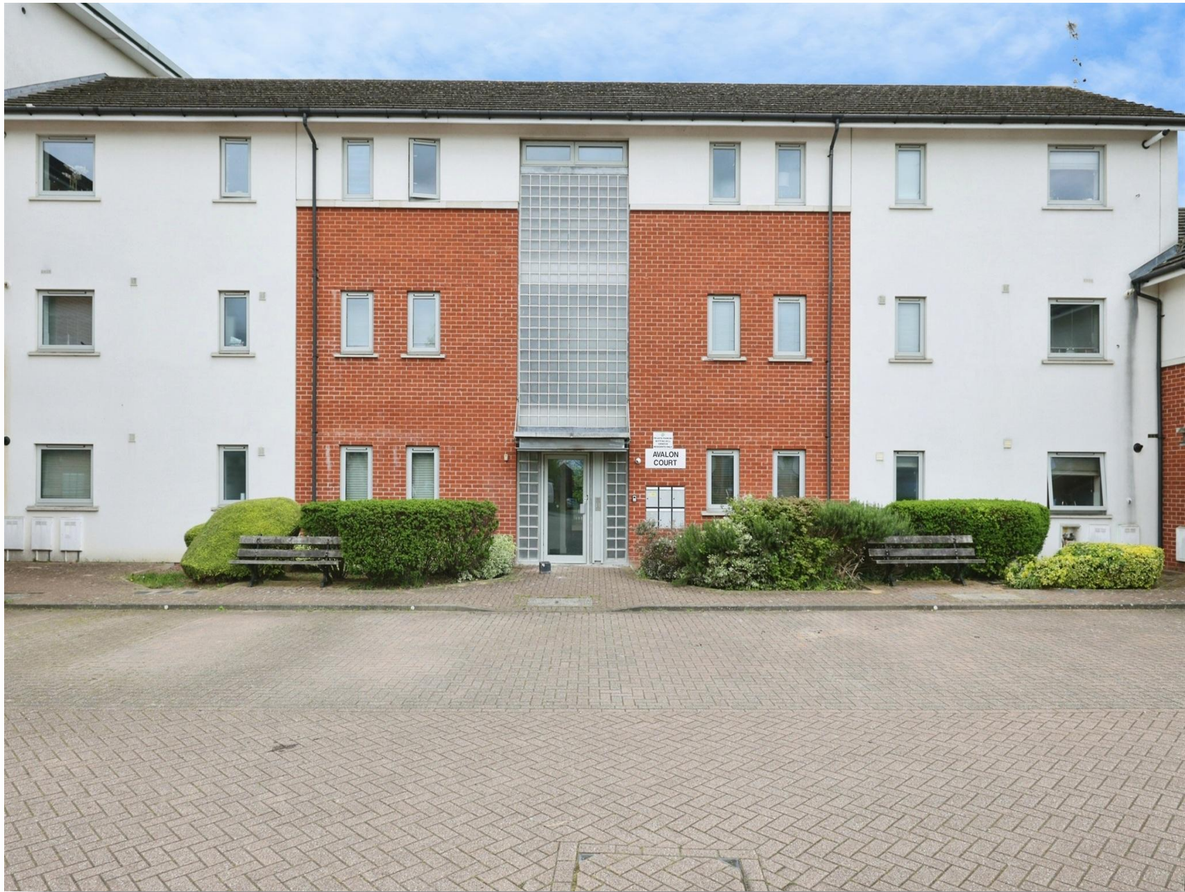
Avalon Court, Hartswood Close, Bushey, WD23 2GF