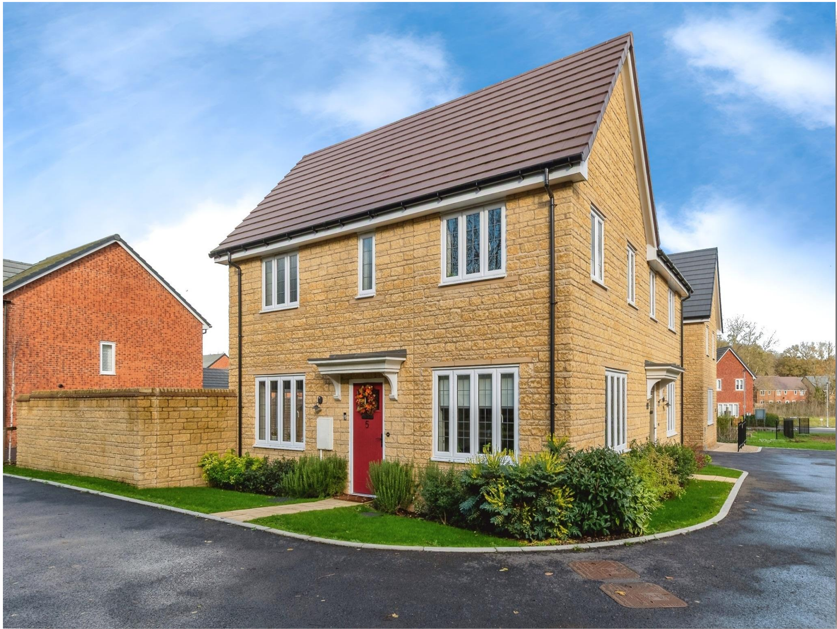
Assart Way, CHIPPENHAM, SN14 0WS