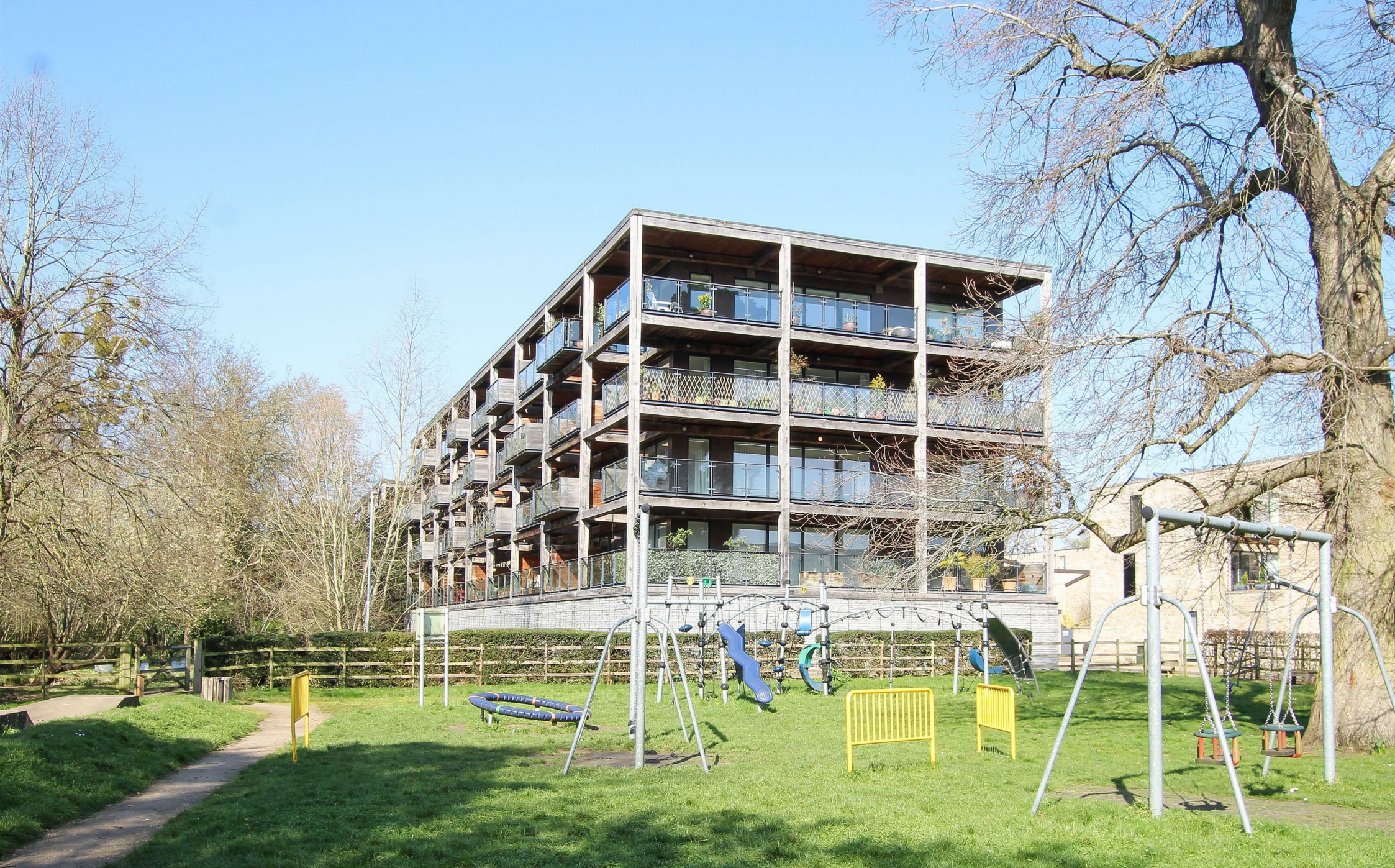
The Copper Building, Kingfisher Way, Cambridge, CB2 8BL