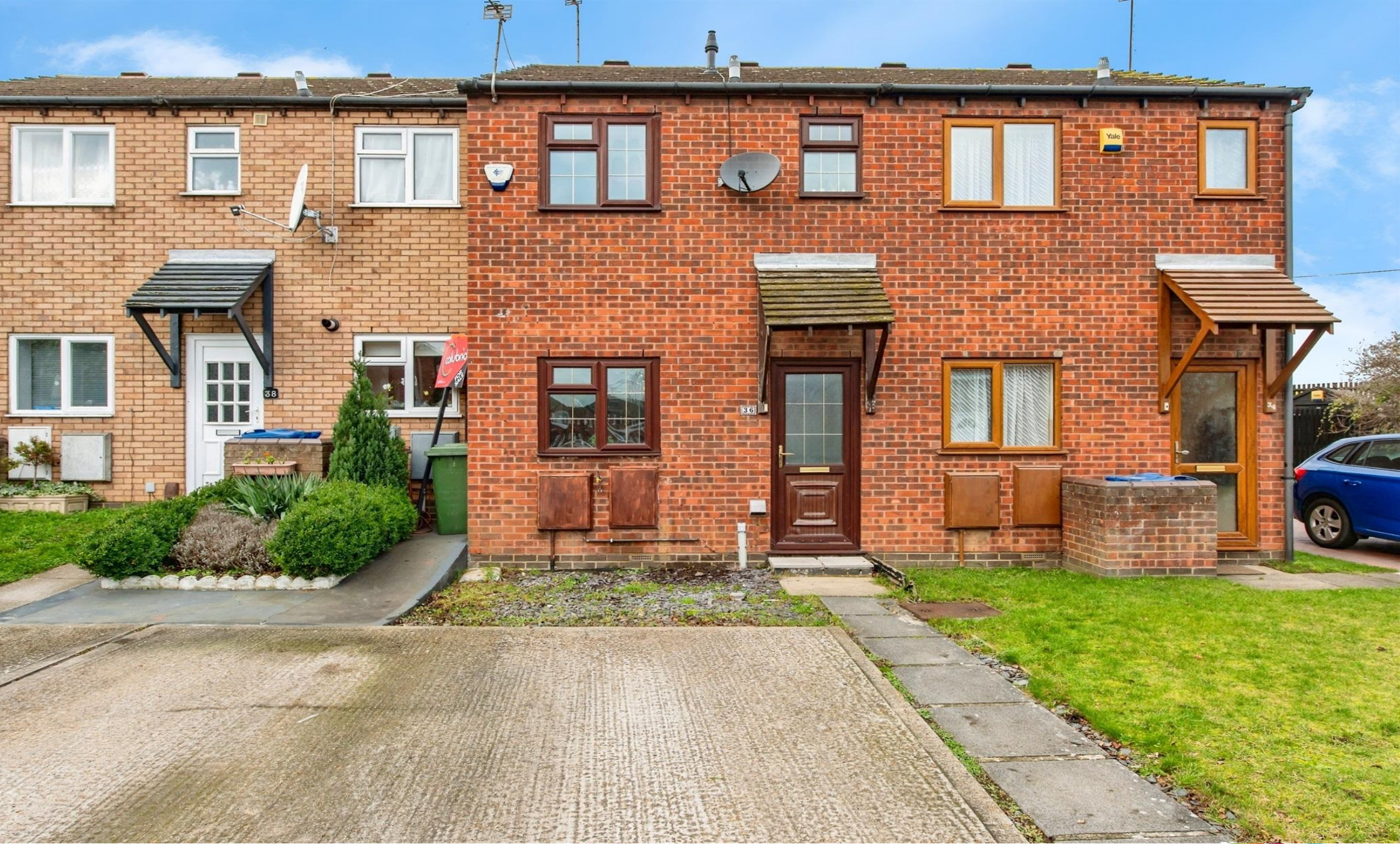
Florence Close, Grays RM20 4AE