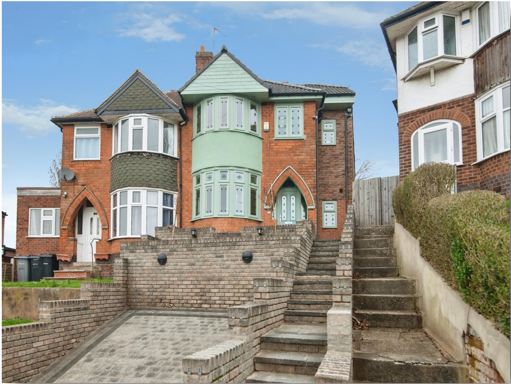
Montana Avenue, Birmingham B42 1QP