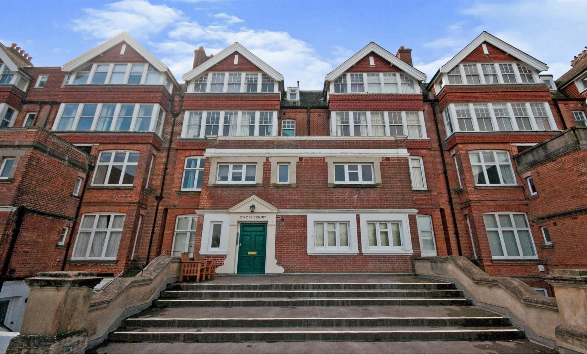
Knole Court - Knole Road, Bexhill-On-Sea TN40 1LN