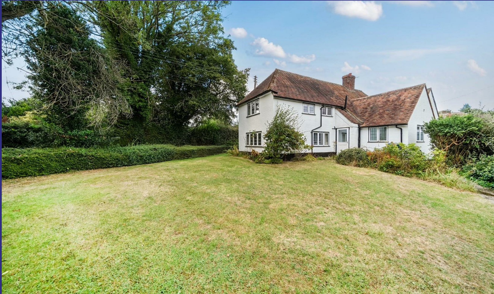
Tamley Lane Hastingleigh