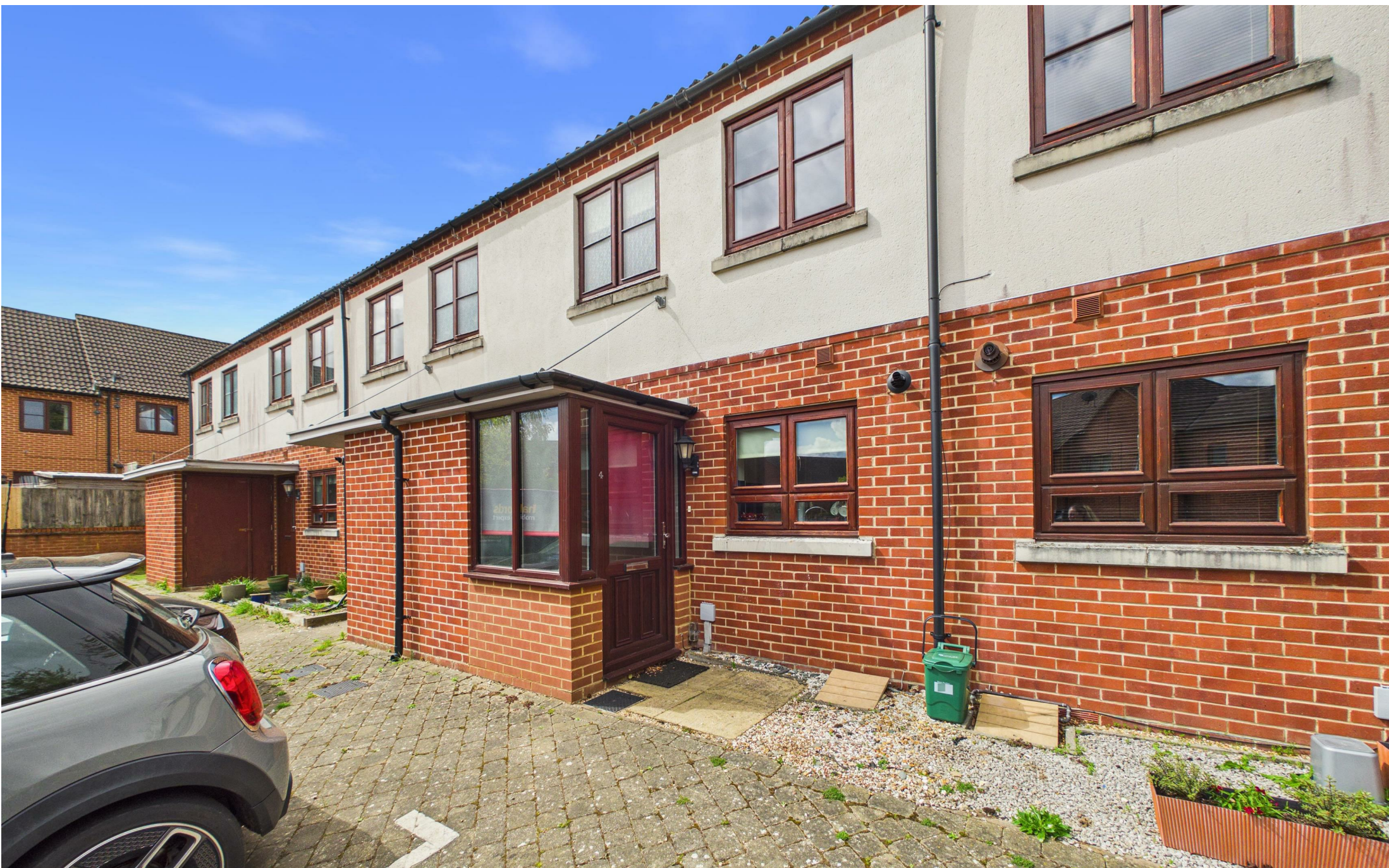
Vernhams Mews, Rooksdown, Basingstoke, RG24 9GE