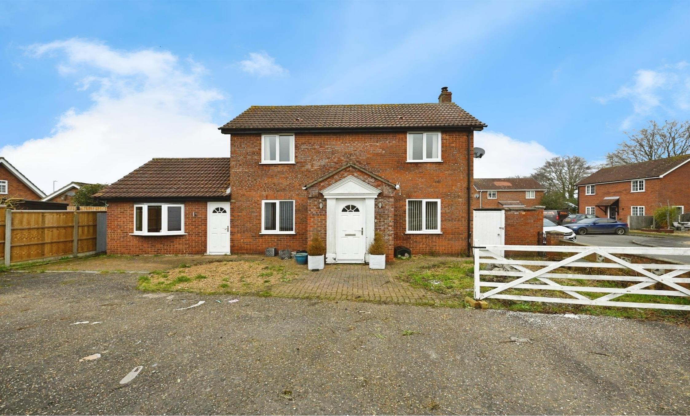
Stebbings Close, Grimston, King's Lynn, PE32 1DJ