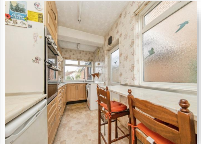
Beechcroft Road, Ipswich, IP1 6BA