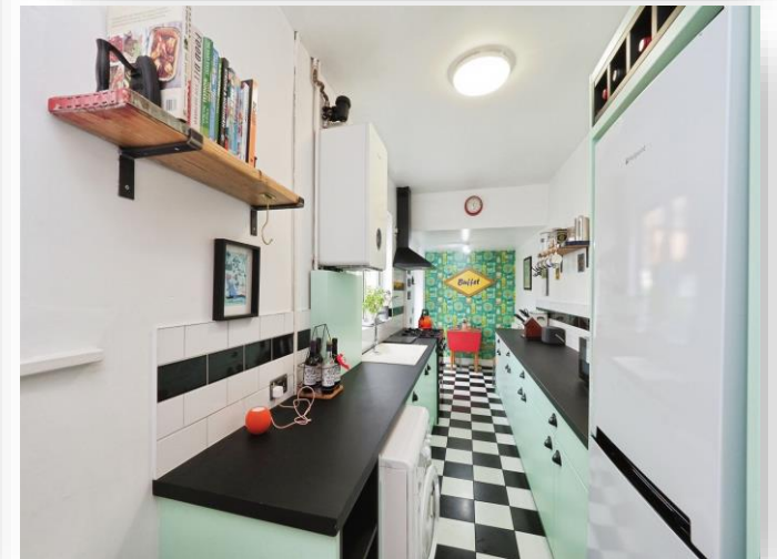
Albert Promenade, LOUGHBOROUGH