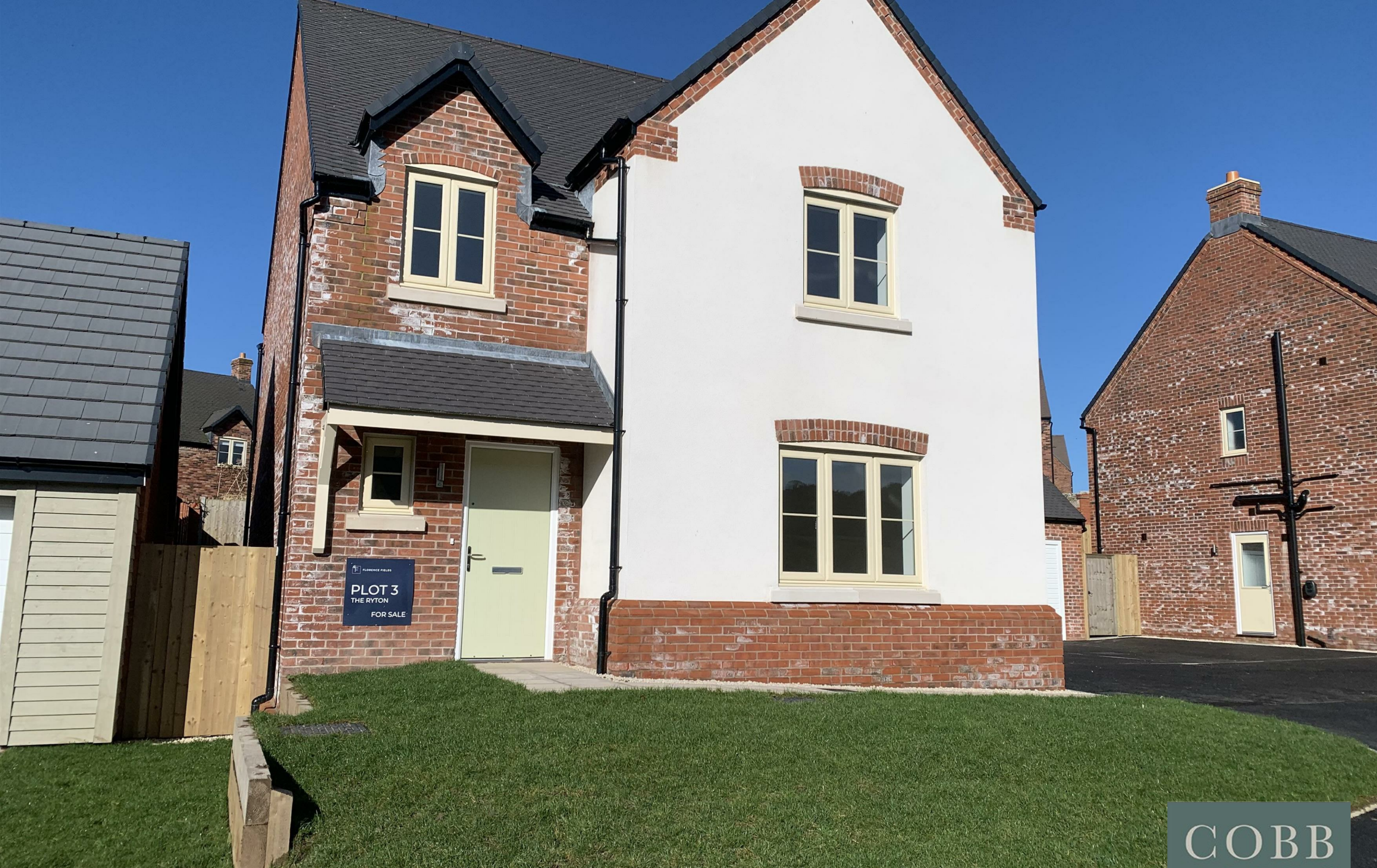
The Ryton, Plot 3, Florence Fields, Leintwardine, SY7 0DF Price £404,995