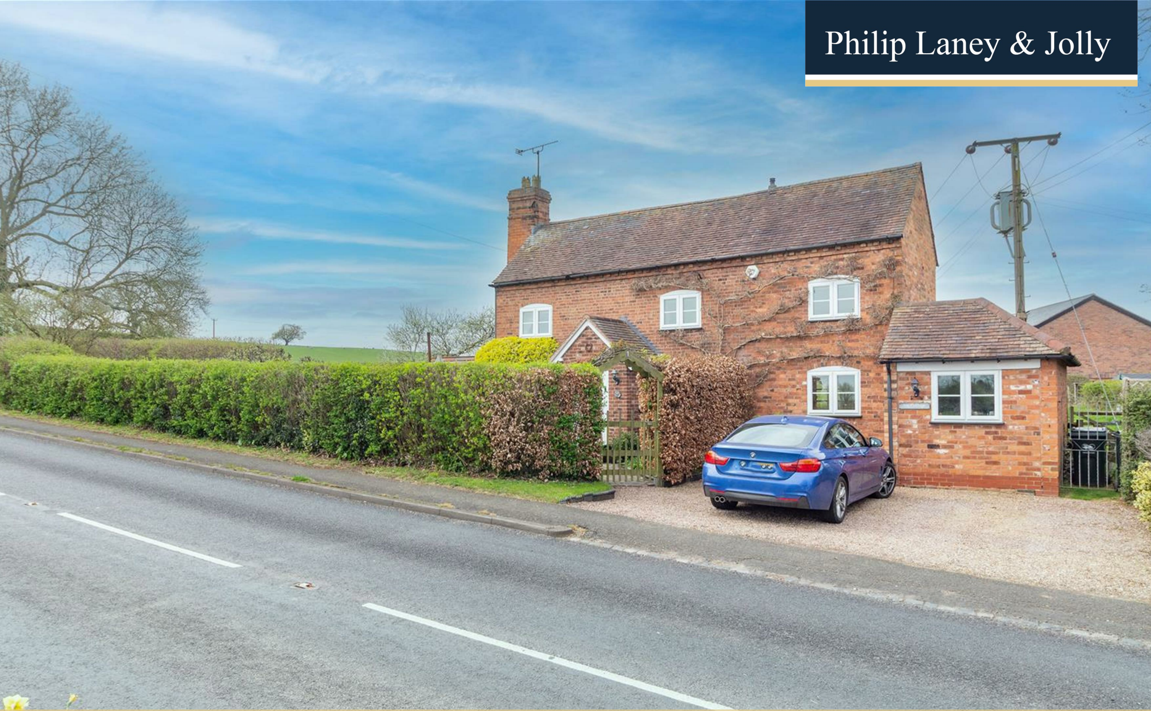
Ivy Cottage 1 Upton Road, Worcester, WR2 4TG Guide Price £450,000