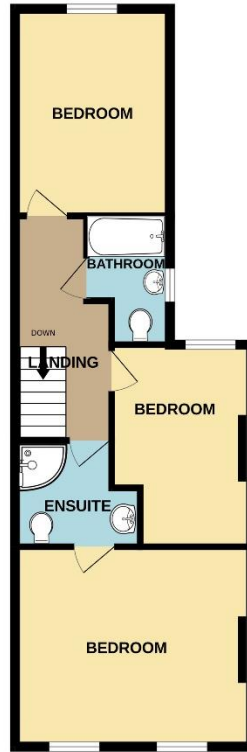
1ST FLOOR 519 sq.ft. (48.2 sq.m.) approx.