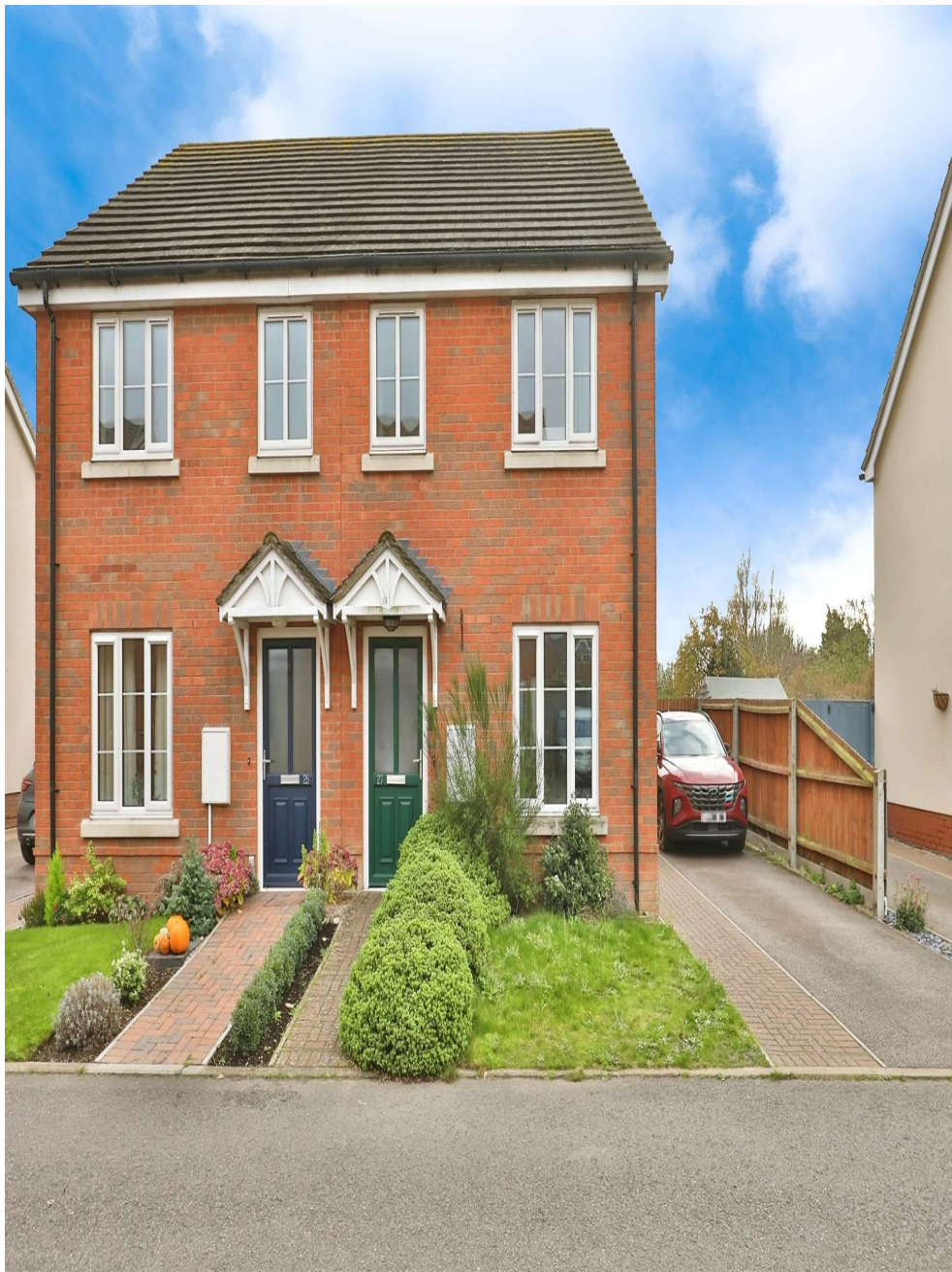
Burghwood Drive, Mileham, PE32 2QU