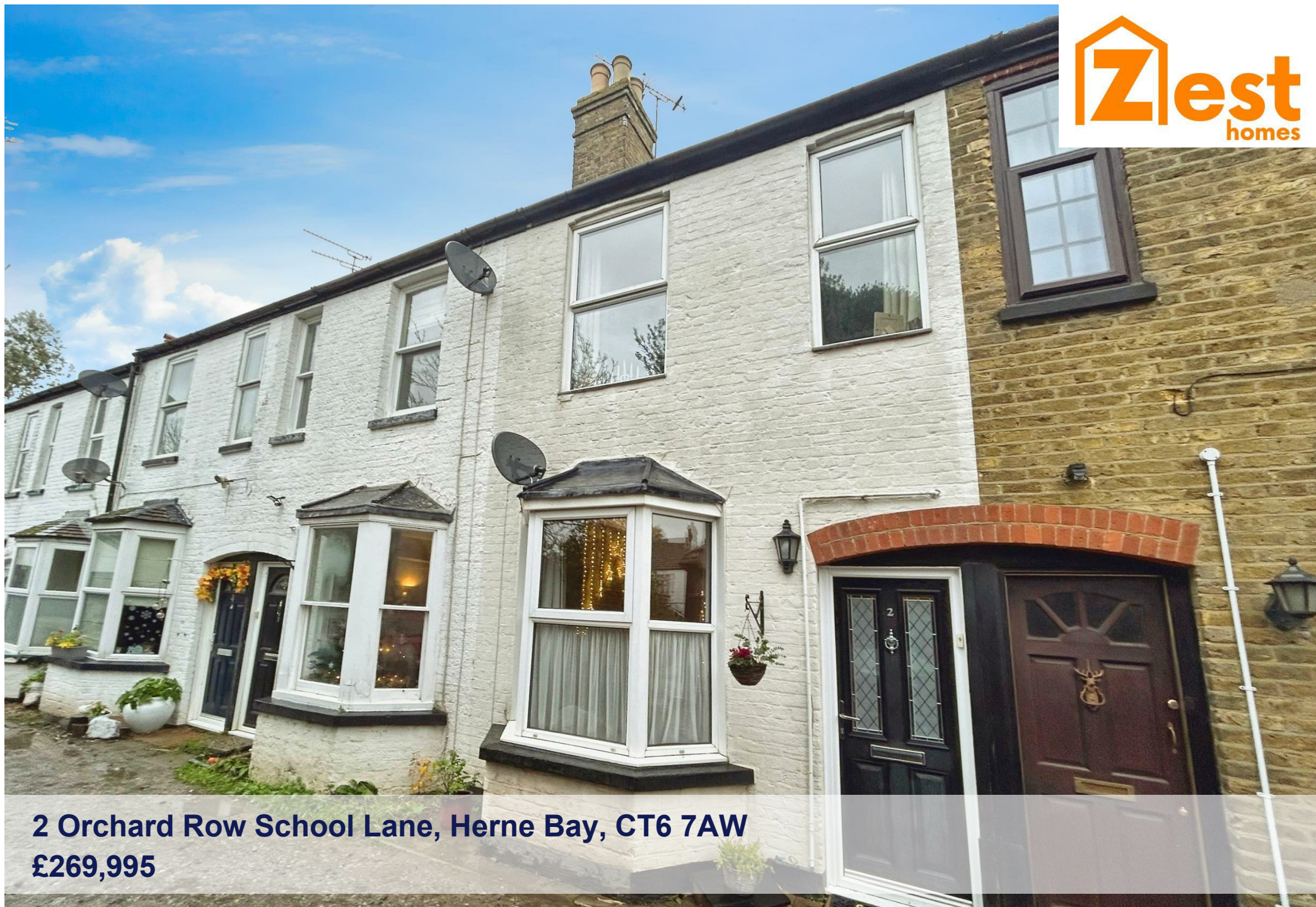
2 Orchard Row School Lane, Herne Bay, CT6 7AW £269,995