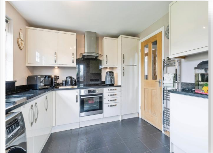
Chichester Close, Hartlepool, TS25 2QT