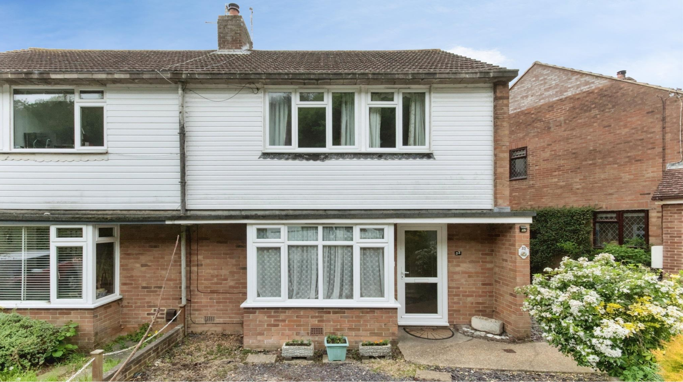
Orchard Road, Lewes BN7 2HB