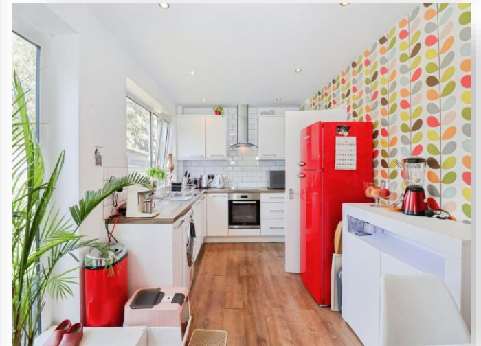
Woodcock Road, Norwich, NR3 3TT