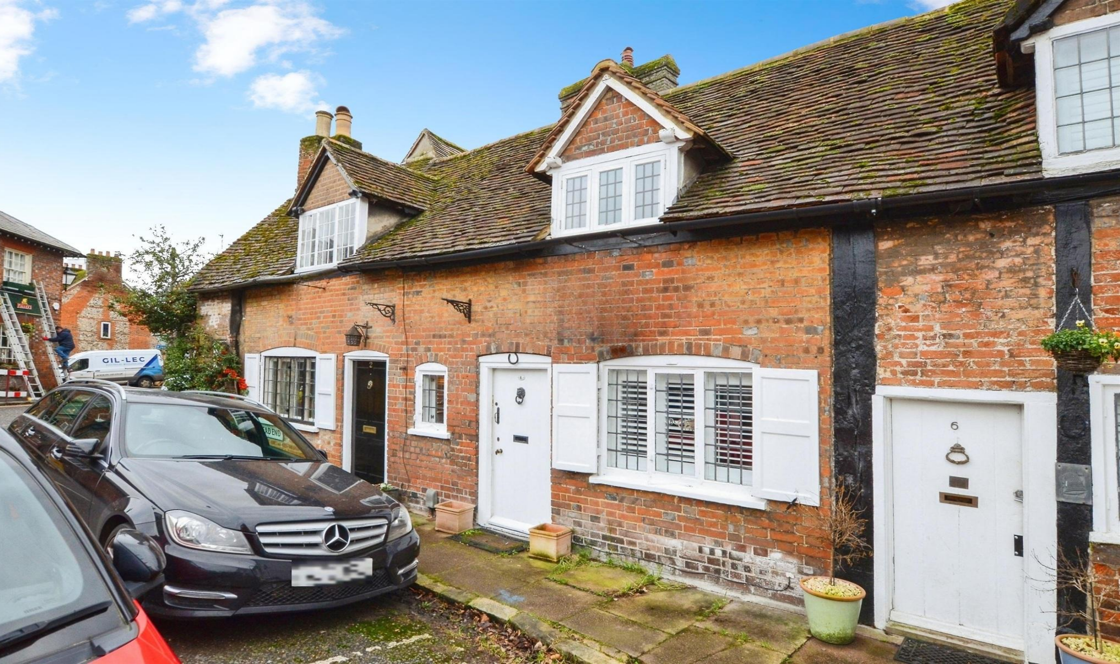
Pednornmead End, Chesham HP5 2JS