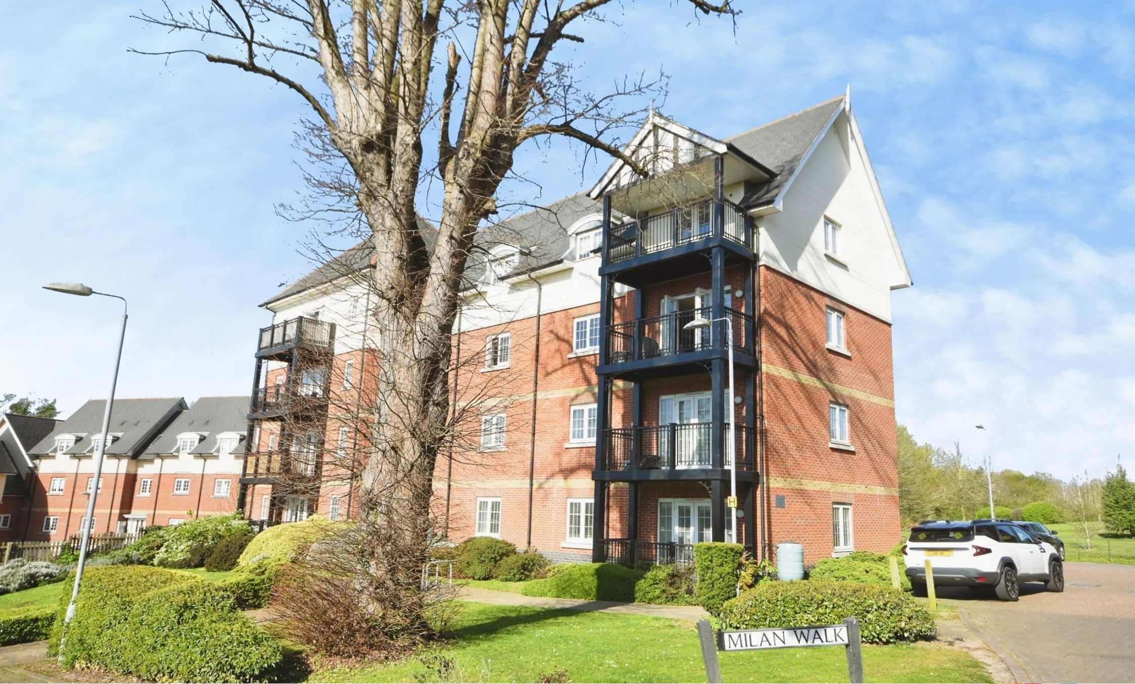
Edmund Rice House, Milan Walk, Brentwood, CM14 4JP