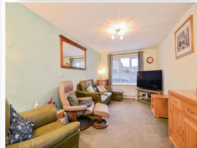
Buckthorn Crescent, Stockton-On-Tees TS21 3LD