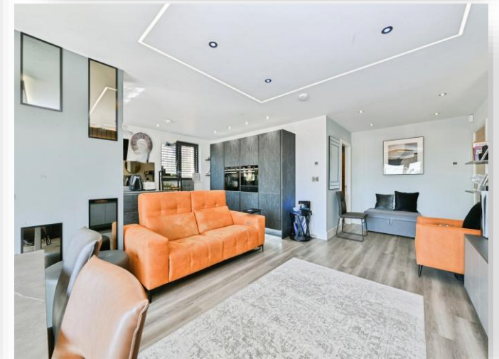
Rebbur House Nicker Hill, Keyworth Nottingham NG12 5ED