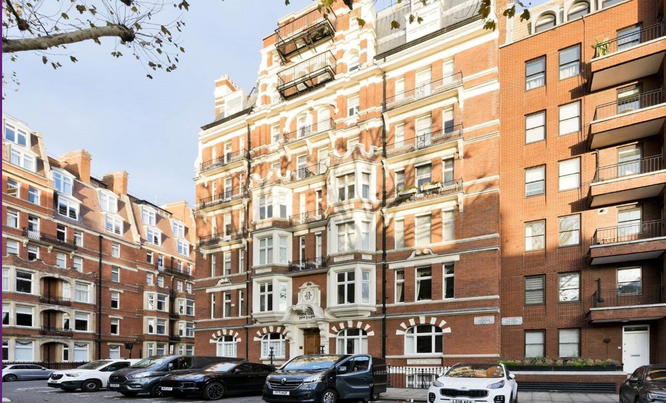
Iverna Court Kensington, W8