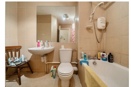
Cypress Road, London, SE25 Approximate Area = 487 sq ft / 45.2 sq m For identification only - Not to scale