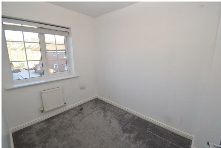
Bedroom 3 8'11" x 6'7" (2.72 x 2.02)

Single bedroom with a radiator and double glazed front window.