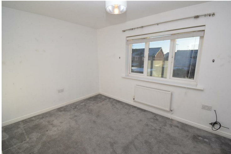
Bedroom 2 13'6" x 9'1">8'4" (4.14 x 2.78>2.55)