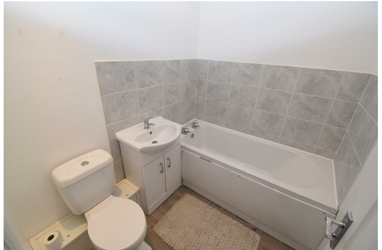
Bathroom 6'7" x 5'7" (2.01 x 1.71)

Three piece suite comprising bath, wash hand basin and WC. With tiled splashbacks, a radiator, ceiling spotlights and an extractor vent.