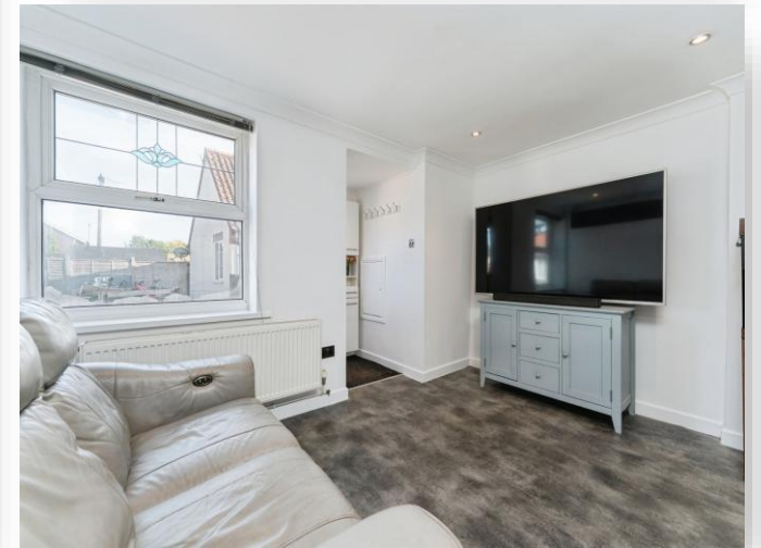
Newtown Road, Ramsey PE26 1EJ