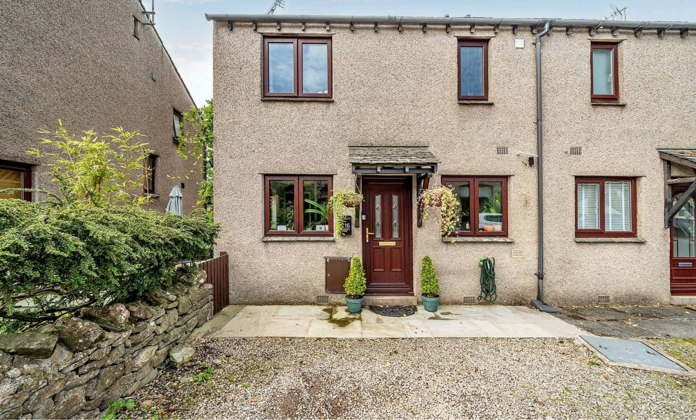
16 Stonebeck, Lindale £245,000