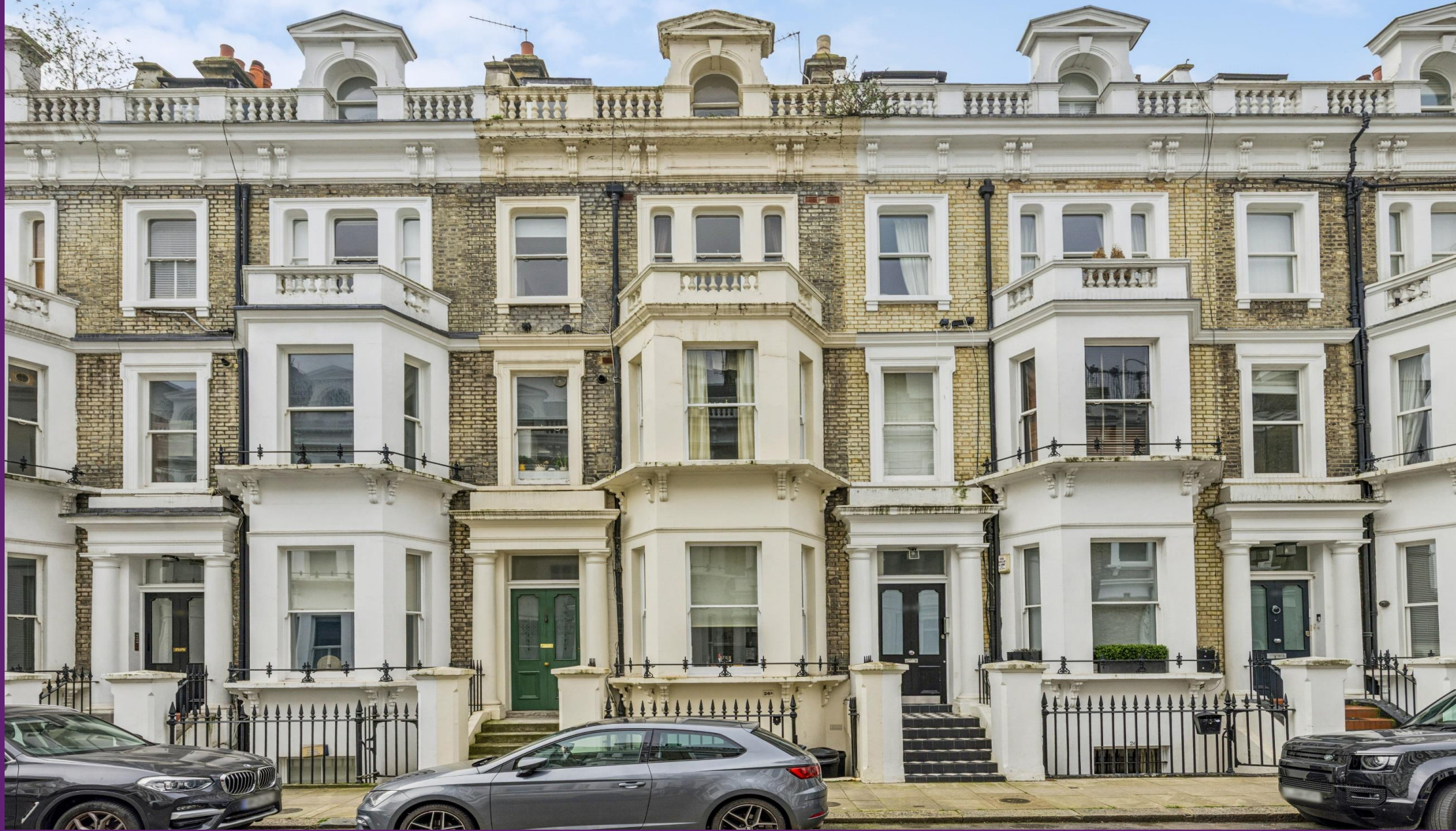
Westgate Terrace Chelsea, SW10