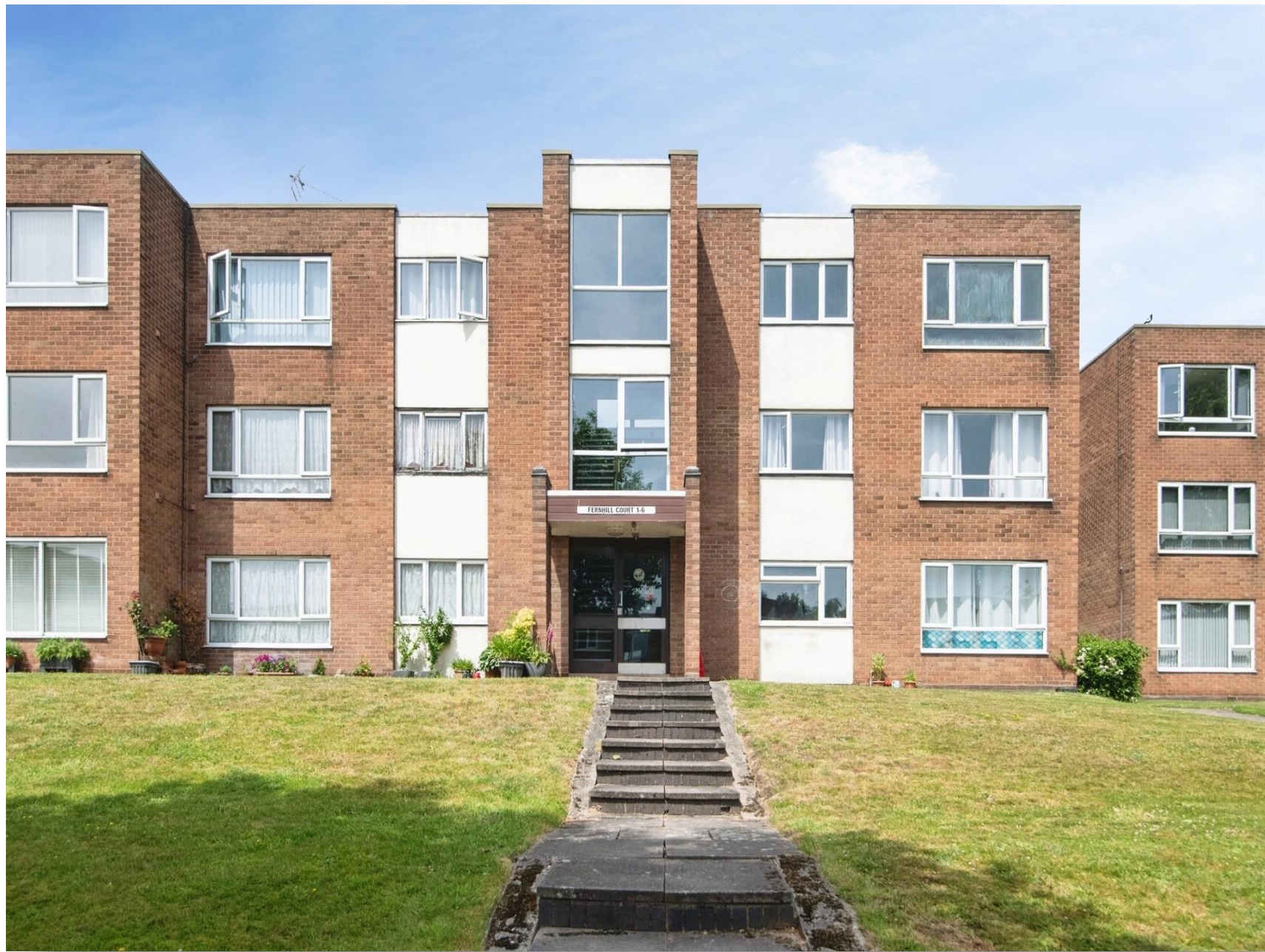
Fernhill Court Stonechat Drive, Birmingham B23 7FN