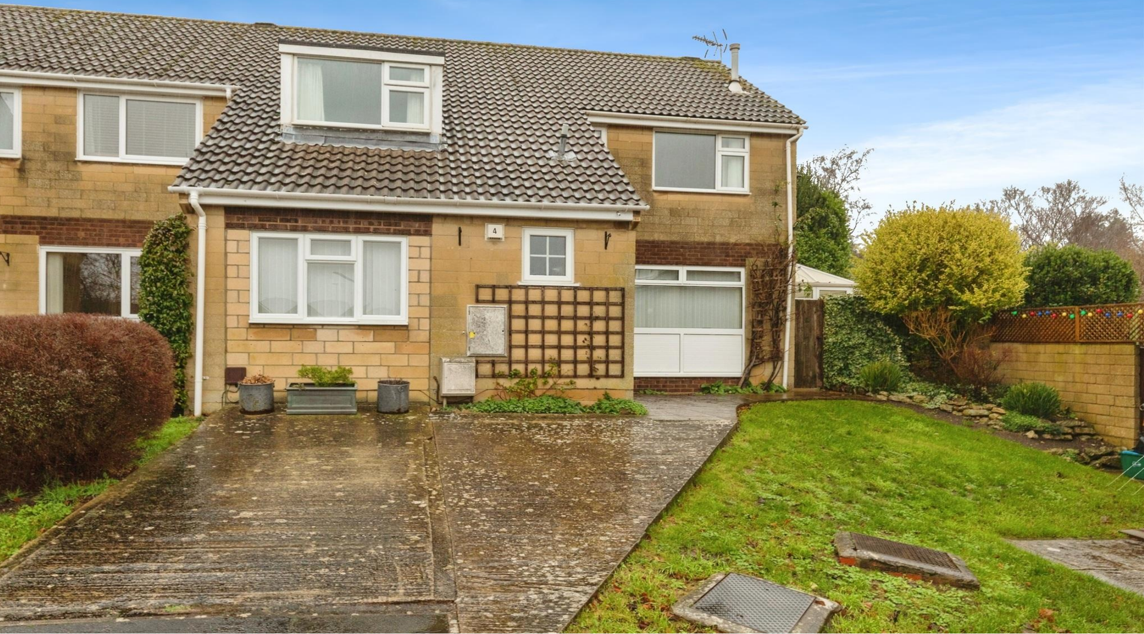
The Linleys, Bath BA1 2XE