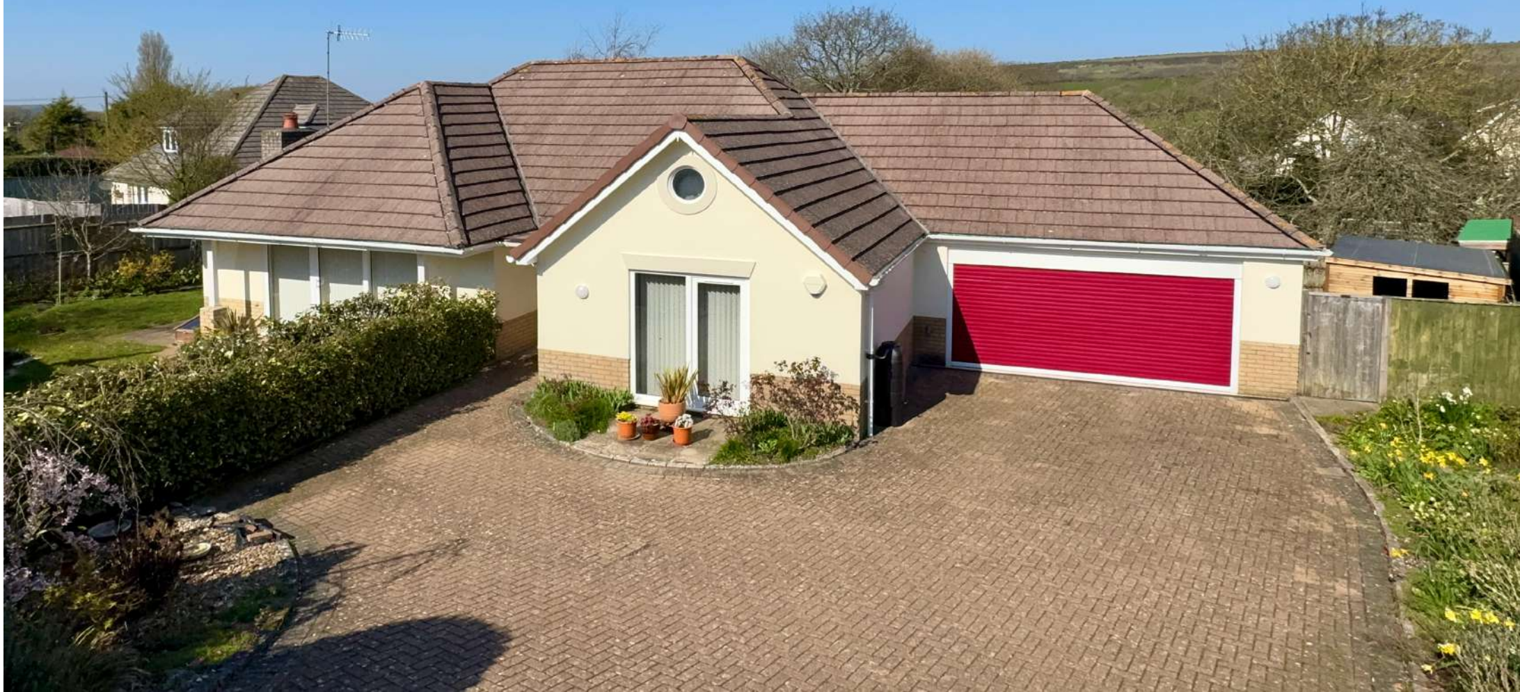
LORELEI, PURBECK VIEW, TABBITS HILL LANE, HARMANS CROSS £650,000 Freehold