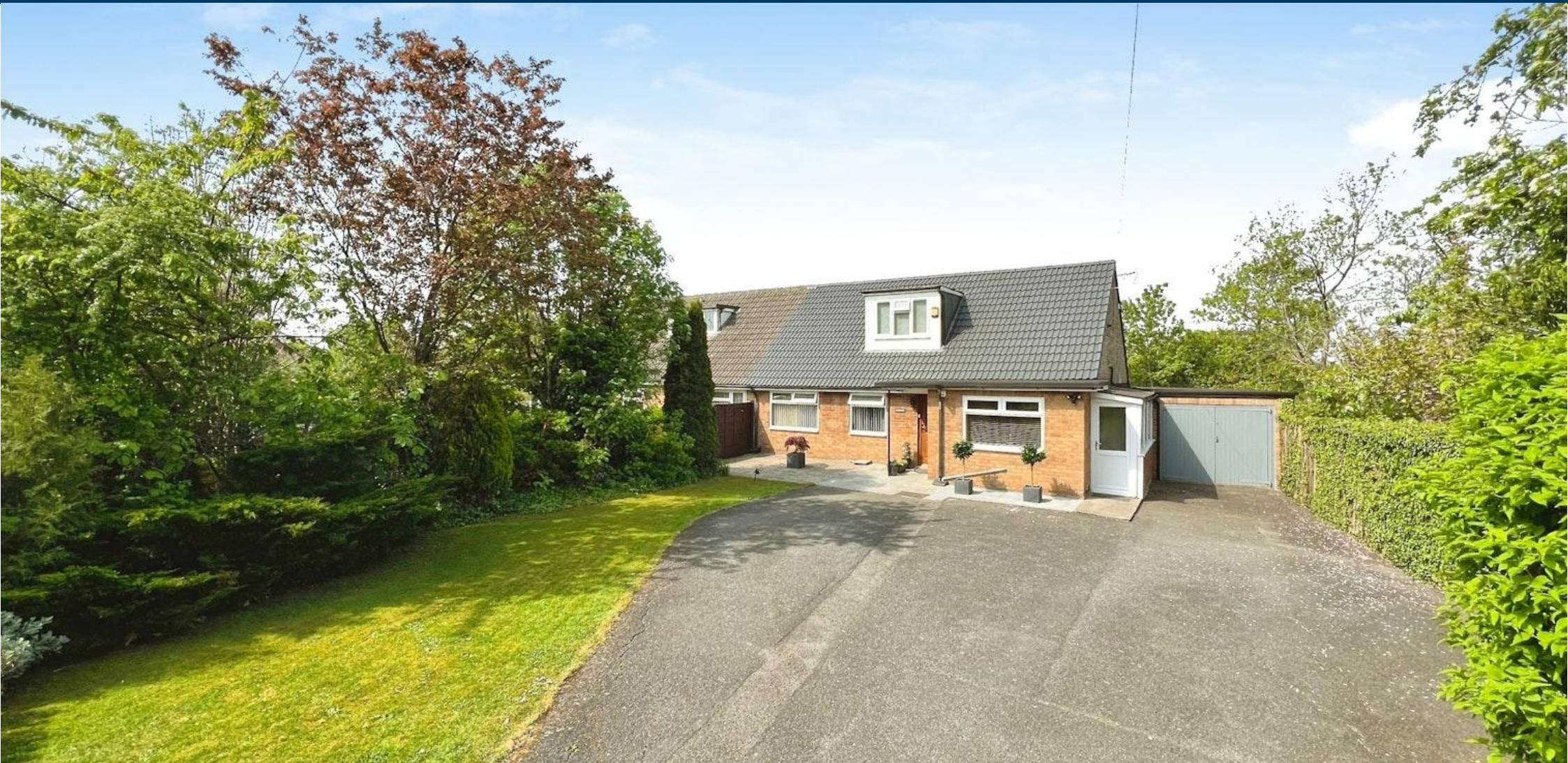
Gorse Rise, Grantham