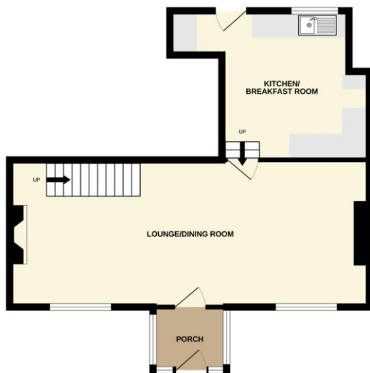
GROUND FLOOR 525 sq.ft. (48.8 sq.m.) approx.