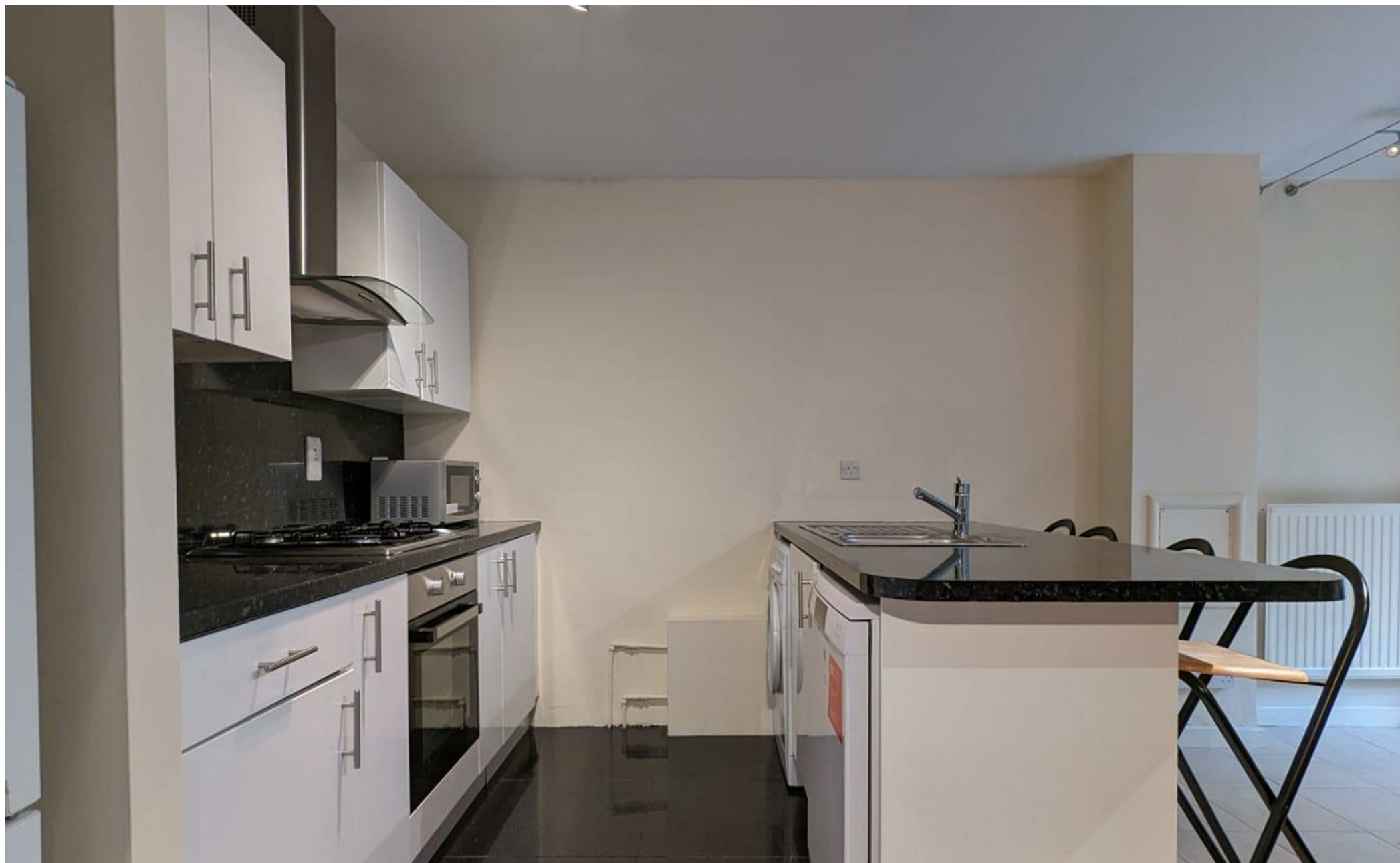
9 Bridgeport Place, Wapping, London, E1W 2JS £2,600 Per month