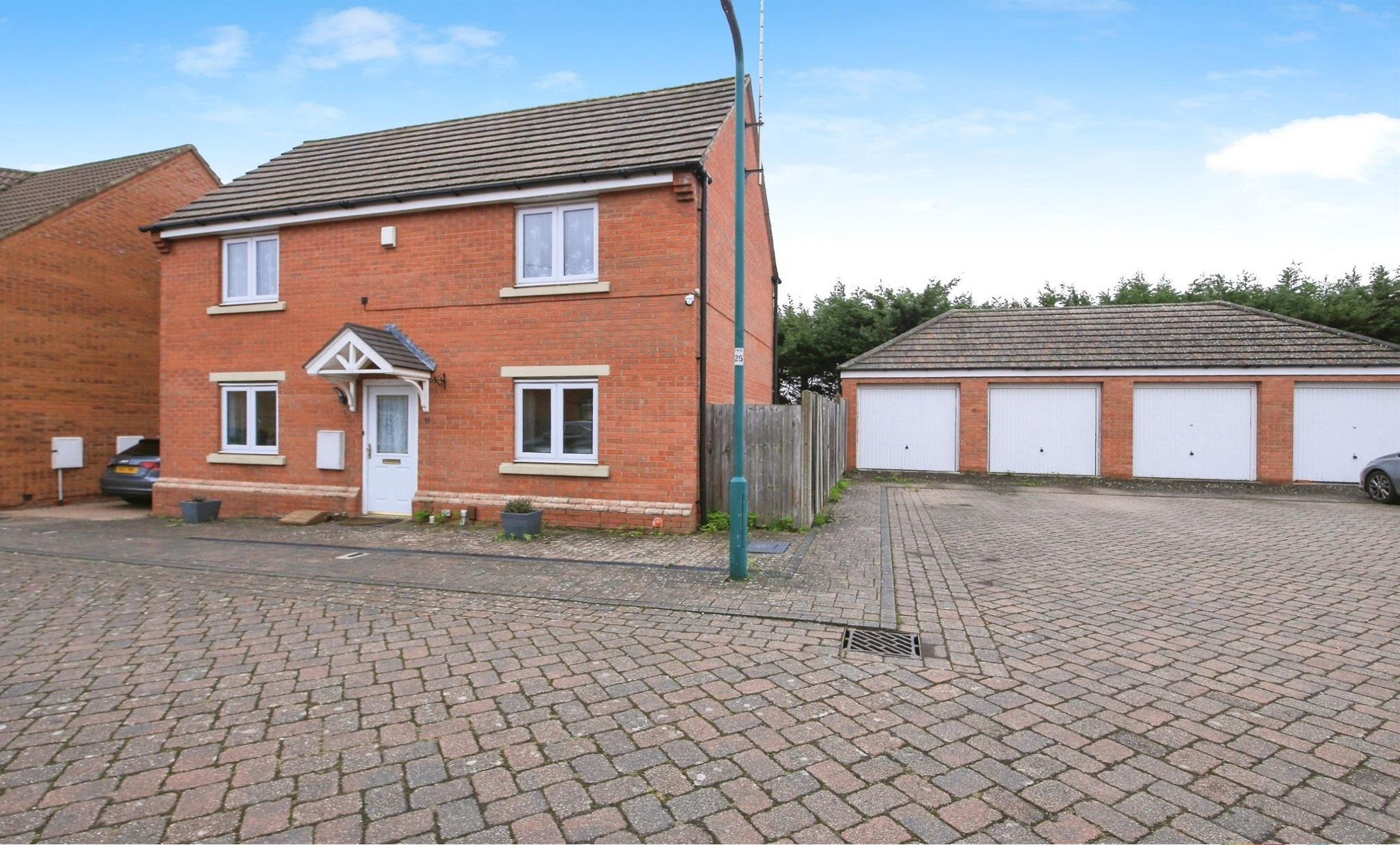
Bayston Court, Peterborough, PE2 9SF