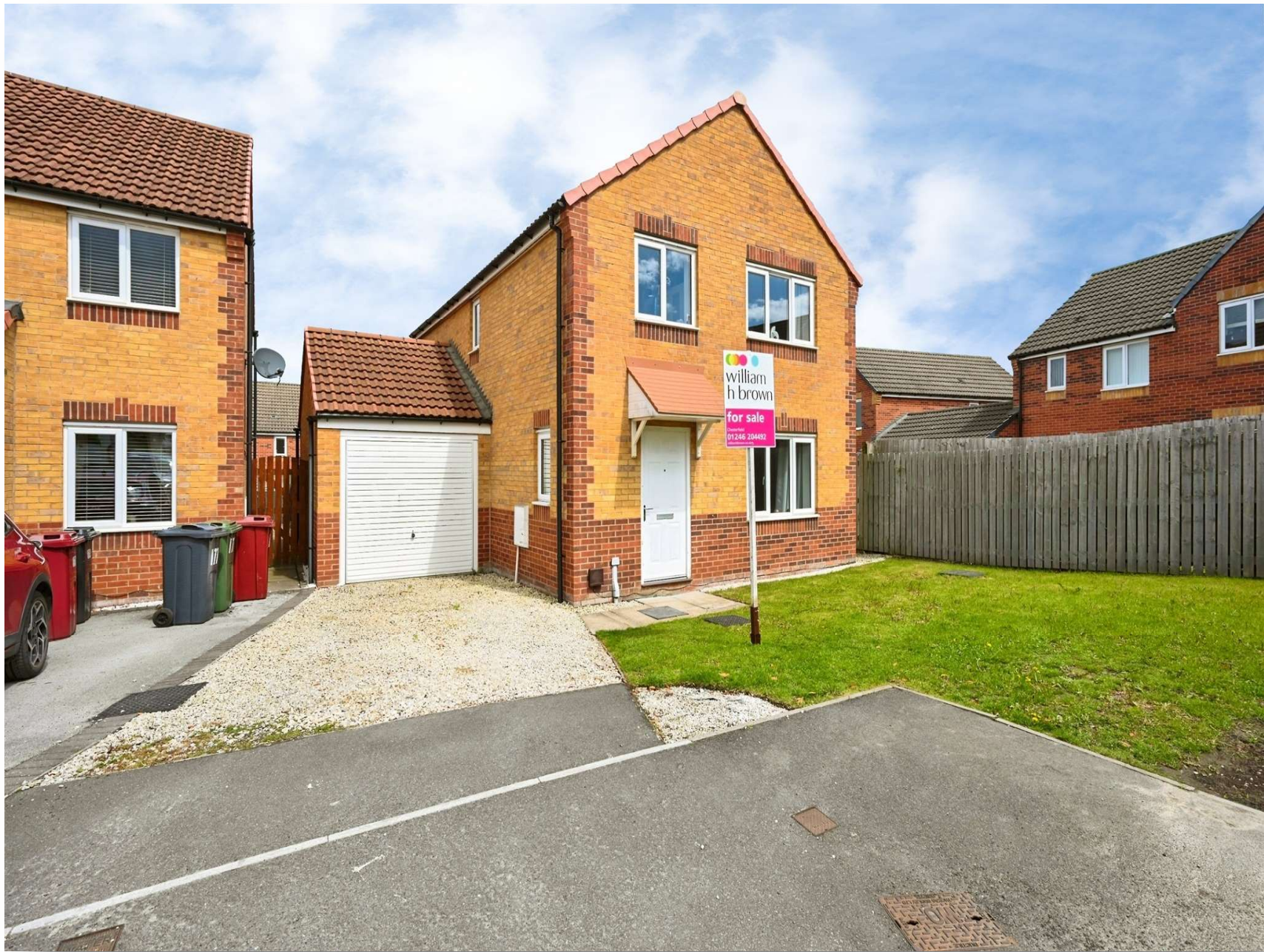
Masefield Avenue, Holmewood Chesterfield S42 5TN